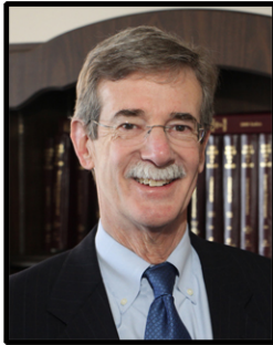
BRIAN E. FROSH ATTORNEY GENERAL

MARYLAND OFFICE OF THE ATTORNEY GENERAL 410-576-6300 1-888-743-0023 TOLL-FREE TDD: 410-576-6372